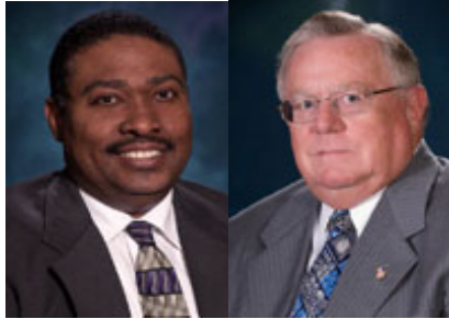
Beusse Sanks Wolter Mora & Maire, P.A.